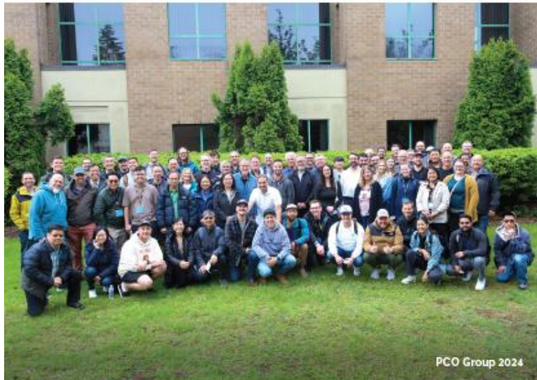
PCO Group 2024